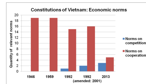
Figure 1 Quantification of cooperation, compromise and competition in Vietnam's constitutions

non-state actors from the colonial period up until the Doi-Moi reforms, the second chapter focussed on the shift in emphasis of these norms in national legislation. Exemplarily the sequence of revised constitutions shows how norms of cooperation decreased vis-à-vis an increase in competitive norms over time.